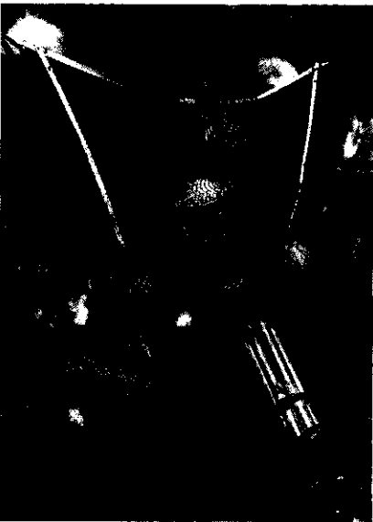
A Huli warrior in ceremonial costume

terest in, and warmth towards, visitors, despite the fact that many of them have a documented history of cannibalism!