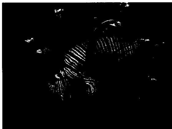
A lionfish parades under PNG's coastal waters.

Much of the artwork revolves around the crocodile, an indigenous animal that plays an important part in the river peo-